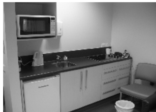
Dialysis Room Home Training Unit Christchurch