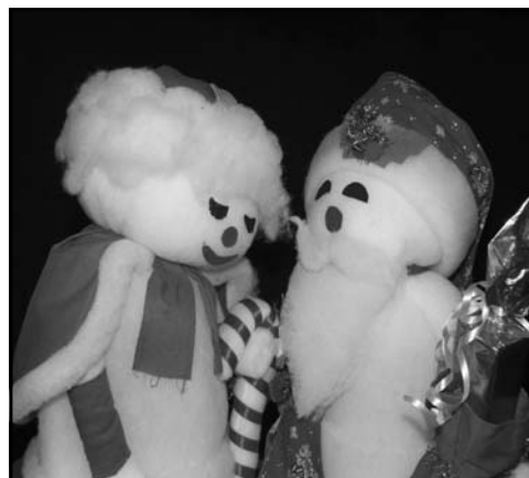
Our cute decorations for the night - aren't they cute!

Where else could you get all that for the price? No where, of course!